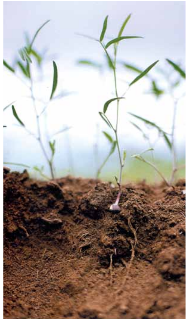
Green manures like this vetch are part of a farmers' toolkit to sequester vast amounts of carbon

The new approach of 'rich-soil' farming reveals that correctly managed agriculture could help us to turn back the carbon clock.